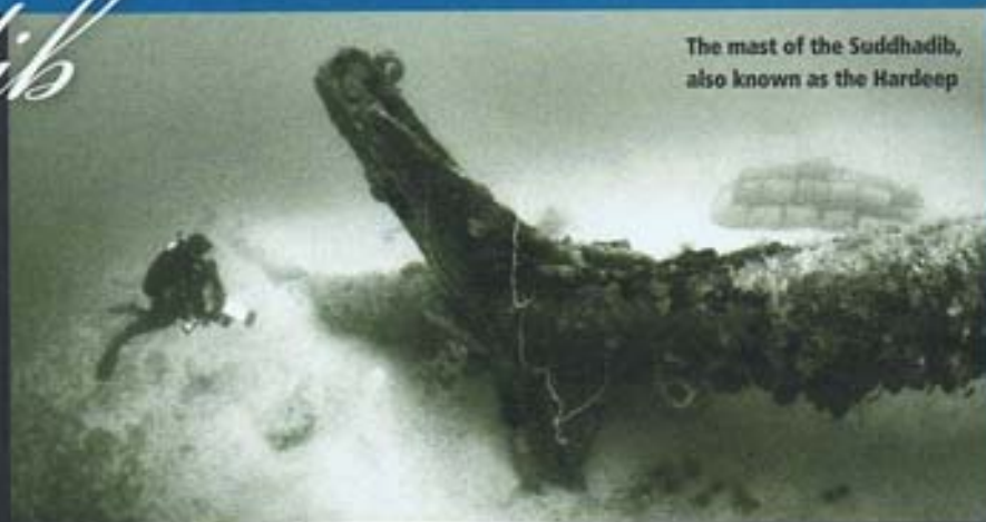
The mast of the Suddhadib, also known as the Hardeep

This 68-metre passenger/cargo vessel, named after the favourite daughter of King Rama V, is now encrusted in coral and sponge growth, and plays host to a range of marine life, including turtles, rays, grouper, pufferfish and other reef dwellers. Penetration is possible into the forward and aft holds, and divers can actually swim its length without leaving the wreck.