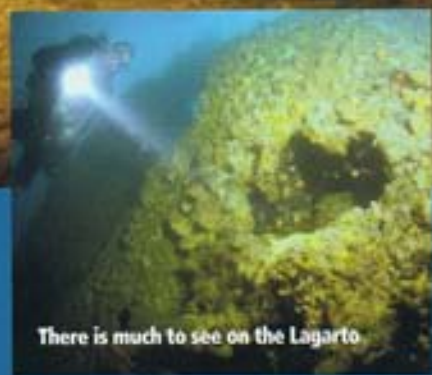
There is much to see on the Lagarto

This 100-metre Balao-class submarine is shrouded in nets but is fully intact, and divers can see the guns, twin propellers, anchor, dive planes, conning tower – complete with target